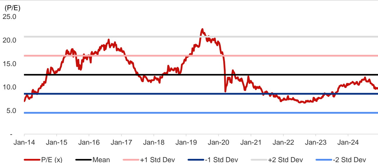
Exhibit 4: BAuto's 1-year forward P/E (x)